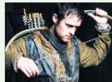
The new BBC Robin Hood – actor Jonas Armstrong.

THROUGHOUT the summer, Bridlington Archers meet at Burton Agnes Sports Field on Tuesdays and Thursdays from 4pm.