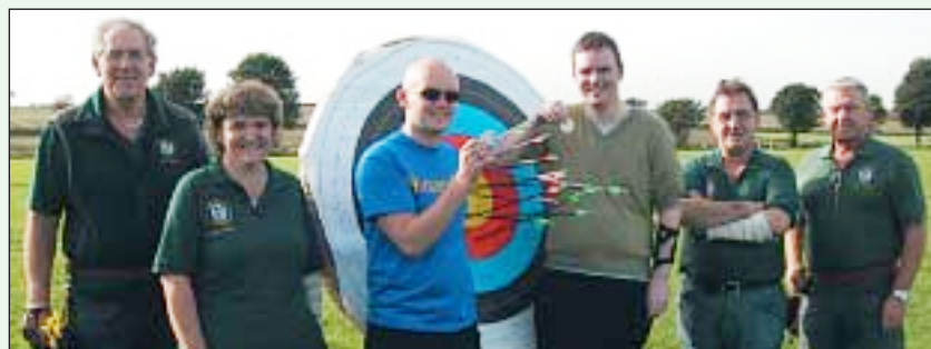
The Free Press boys sherry-wood like another go with the Bridlington Archers.